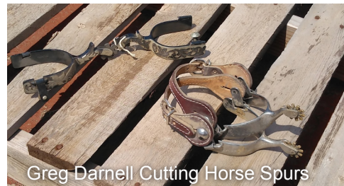
Greg Darnell Cutting Horse Spurs