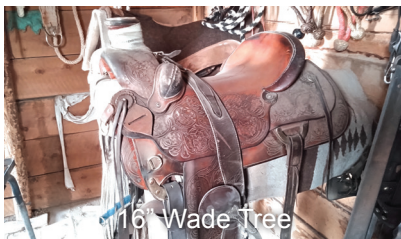
16 Wade Tree