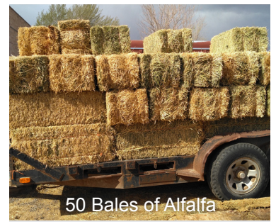
50 Bales of Alfalfa

It's time! A life spent collecting unique, serviceable and eye-catching horse equipment, tack and accessories will culminate in sharing those pieces with other like-minded horse lovers. We will do it, "All in a day, the Auction way," May 1st at 11:00 a.m. in Elsinore, Utah.