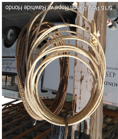
5/16 Poly Ranch Rope w/ Rawhide Hondo