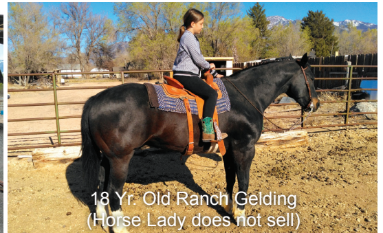
18 Yr. Old Ranch Gelding (Horse Lady does not sell)