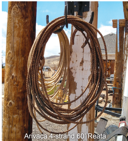
Arivaca 4-strand 60' Reata

Note: All items sell, "As-Is, Where Is" Use your best "Buyer's Judgement." Trailer title will be mailed following deposit of good funds. Brand Inspection on the gelding will be printed after the new buyer is identified.