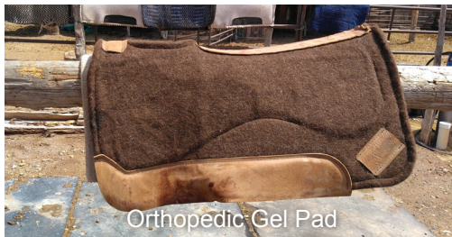
Orthopedic Gel Pad