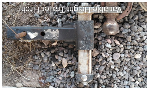
Variable Height Trailer Hitch