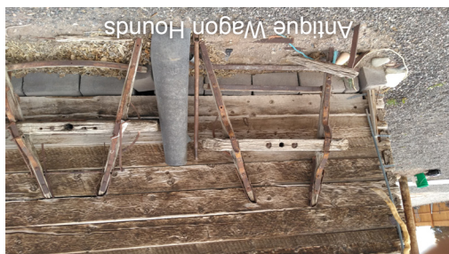
Antique Wagon Hounds