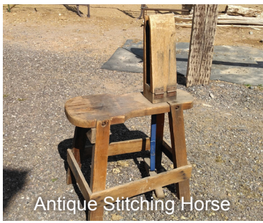
Antique Stitching Horse

He's not a Real Cowboy, HE sold his saddle!!!