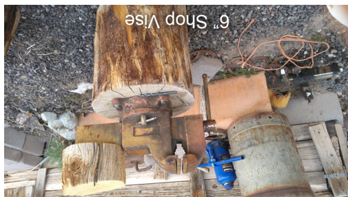
6" Shop Vise