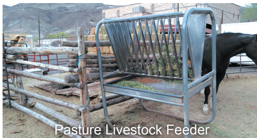
Pasture Livestock Feeder